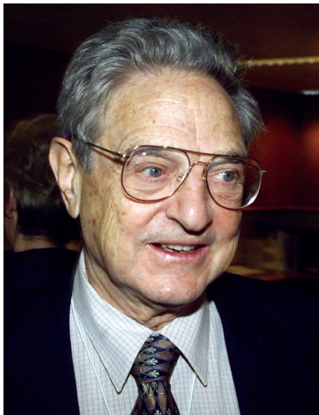
Not even he knows. George Soros, one of the world's most successful investors

T HE CURRENT ROLLER COASTER of share prices in both local and international markets will highlight the uncertainties of short-term share price move-